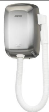
SC0009CS Satin finish