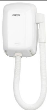
SC0009 White finish