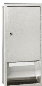
DTE0040CS Satin finish