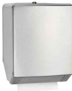
DT0208ACS Satin finish