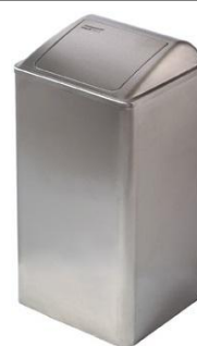
PP0065CS / PP0080CS