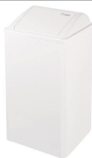
PP0065 / PP0080