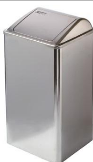
PP0065C / PP0080C