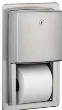
PRE700CS Satin finish