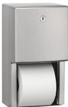
PR0700CS Satin finish