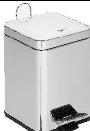
PP1206C / PP1214C Bright finish