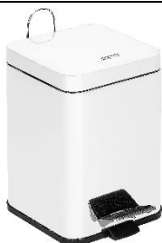
PP1206 / PP1214 White finish