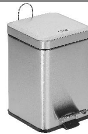
PP1206CS / PP1214CS Satin finish