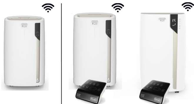
EL110 WIFI EcoReal Feel