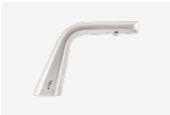
The Ribbon Soap Dispenser TSL.R011