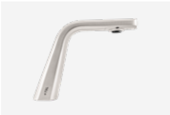
The Ribbon Sensor Tap 2.0 TSL.R021