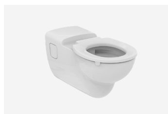
Wall Hung 750mm Projection WC TSL.WH750.001