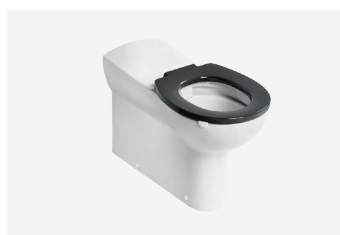
Floor Standing 750mm Projection WC TSL.FS750.001