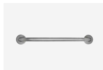
Straight Grab Bar - 600mm TSL.GR45.600