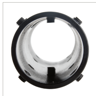
Supplied with optional short safety bolts to allow cables to pass through