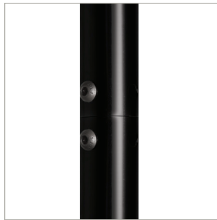
Creates a seamless pole join