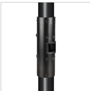
Grub screws which allow micro-adjustment of pole angle