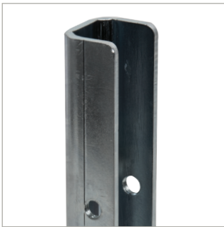
One-piece design for a quick install