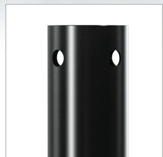
Features safety bolt holes at the top and bottom for secure installation