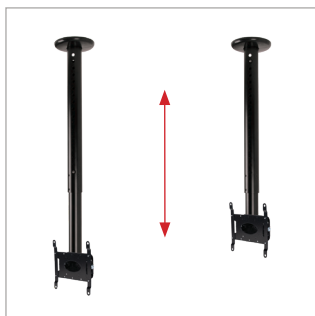
Quick and easy 'push button' height adjustment