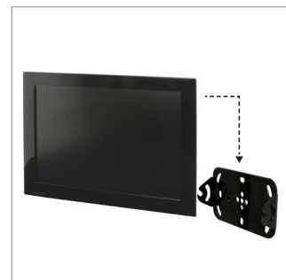
Simple 'hook-on' installation