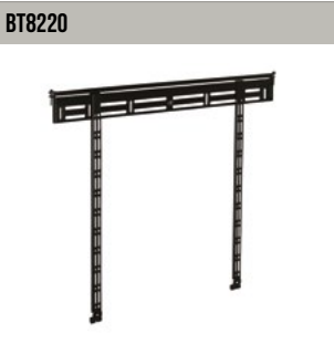
BT8220 Ultra-Slim Universal Flat Screen Wall Mount for screens up to 80"