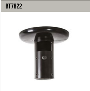
BT7822 Heavy Duty Floor / Ceiling Mount Can be used in conjunction with B-Tech poles and collars to create pole mounted solutions