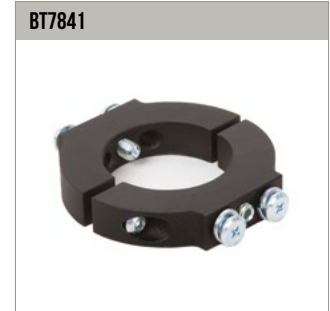
BT7841 50mm Accessory Collars can be fixed to the BT8432 to allow the mount to be attached to a pole