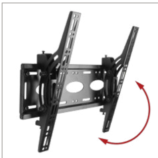
Unique 'Torsion-Tilt' mechanism allows for easy tilt adjustment up to +/-15°