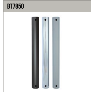
BT7850 50mm Diameter Poles are available in a choice of 6 lengths and can be used to create multiple pole mounted solutions