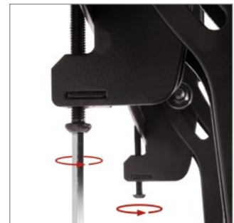
Security locking screws and Allen key provided for a secure installation