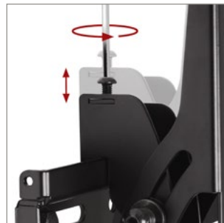
Arms feature levelling screws to adjust the screen height once mounted