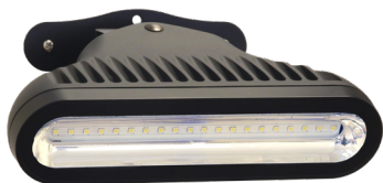
2 x Clarius Star Floodlight VCS-20