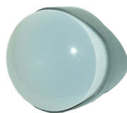
2 x Opal XL GJD020