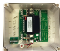
1 x 4 Zone expansion unit GJD040