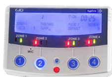
1 x DygiZone GJD910