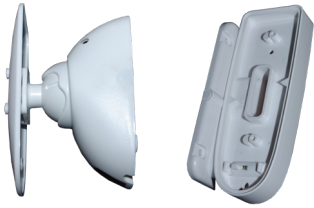
Swivel Bracket T-Bracket