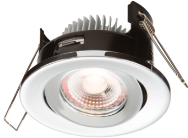
VFR8TCW shown with VFR8TBEZCH (not supplied)