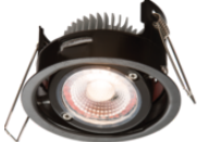
As supplied without bezel