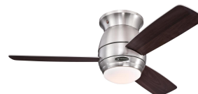
Reversible Dark Cherry Finish Blades