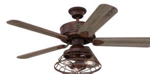
Reversible Pewter Ash Finish Blades