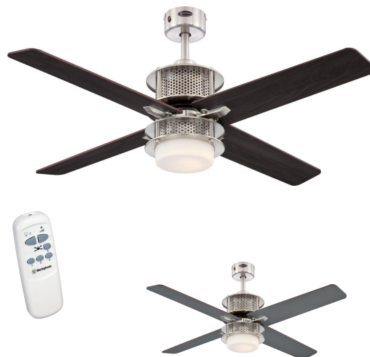
Reversible Graphite Finish Blades