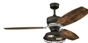
Reversible Reclaimed Hickory Finish Blades