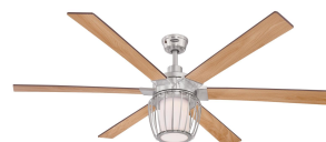
Reversible Beech Finish Blades