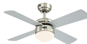
Reversible Silver Finish Blades