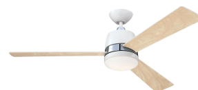
Reversible Light Maple Finish Blades