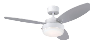
Reversible Silver Finish Blades