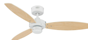
Reversible Light Maple Finish Blades